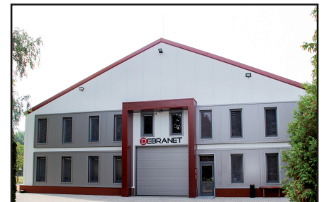
The new warehouse

Zoltán: Of course, this will make a huge difference. We can work much more efficiently, with much bigger stocks and supply.