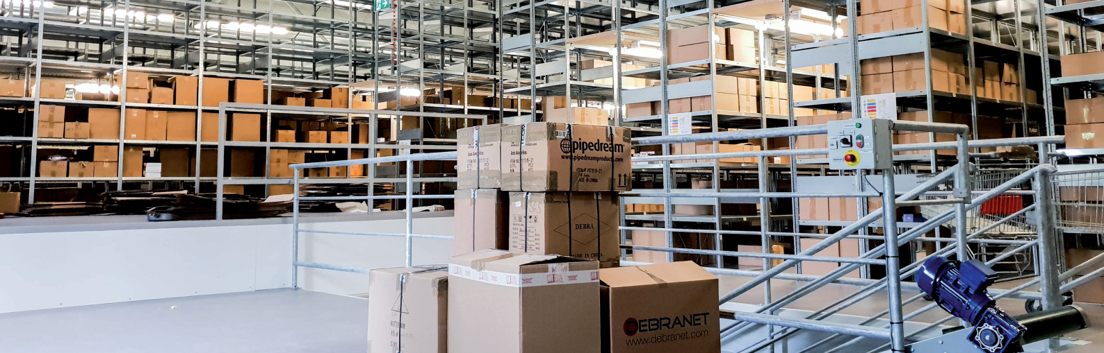
Inside the warehouse

Now that you've created more room, you can move ahead with your expansion strategy. What will be the next step?